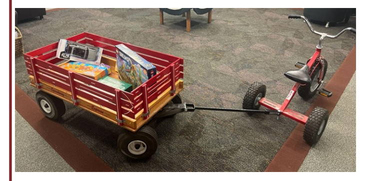
This wagon was filled to overflowing with all sorts of toys for kids at Children's Hospital!