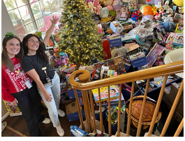
Delivery of all the toys!